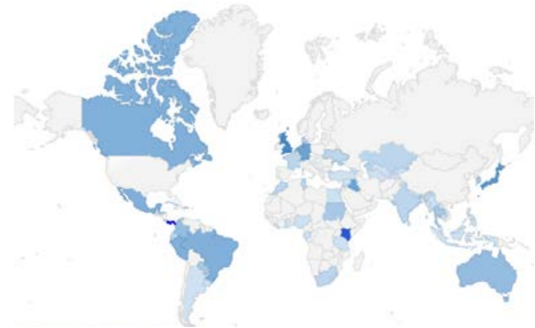
Heatmap of the Smithsonian's 2023 Global Activity Profile submissions.

The accomplishments of J-1 scholars at the Smithsonian are as impressive as they are diverse. Two 2023 J-1 scholar co-presented papers at the 71st ASMS Conference on Mass Spectrometry and Allied Topics held in Houston, Texas. Two others saw their paper, Comprehensive phenotypic phylogenetic analysis supports the monophyly of stromateiform fishes , honored with an award from the Brazilian Society of Zoology as the best taxonomic study published in the 2019-2021 timeframe. Finally, Newsweek covered the work of a Smithsonian J-1 scholar who collaborated with a curator at the National Museum of Natural History on the discovery and description of a new species based on an uncatalogued fossilized tooth in the museum's paleobiology collection. The enigmatic tooth belonged to a Desmostylus , a bizarre group of hippo-like marine mammals that lived more than 20 million years ago.