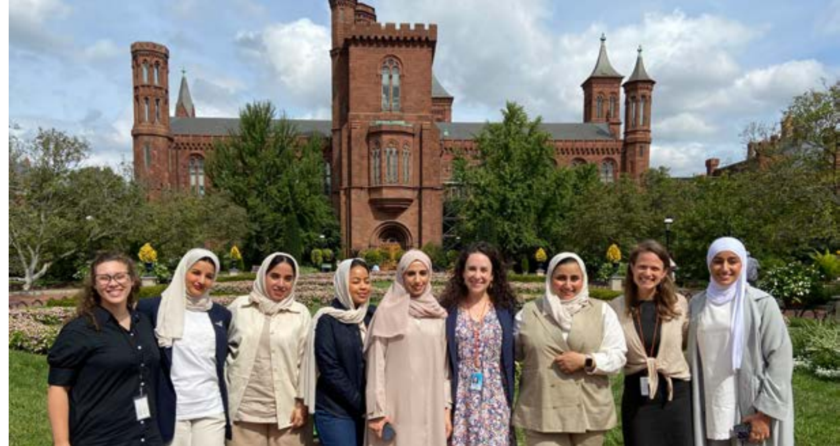
Members of the Department of Culture and Tourism - Abu Dhabi visit Washington, DC in September for a knowledge tour focused on best practices in visitor services.

As part of a multi-year exchange program with museums and sites within the portfolio of the Department of Culture and Tourism – Abu Dhabi , Smithsonian colleagues across the Institution have engaged in mentorships, meetings, and more sustained dialogues on topics ranging from visitor services to public programming, and from strategic planning to festival management.