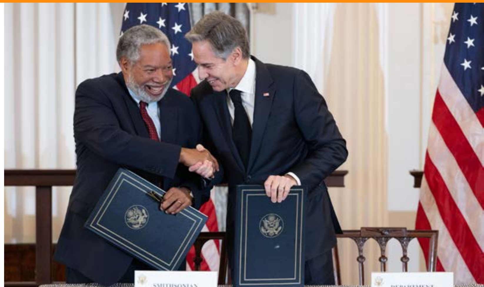
Smithsonian Secretary Lonnie G. Bunch III and Secretary of State Antony Blinken celebrate the signing of a new agreement between the two organizations.

The new agreement has already laid the foundations for novel forms of collaboration: Smithsonian experts can now participate in State's Embassy Science Fellows Program which places scientists in short-term fellowships at US embassies around the world to tackle local challenges with global importance. State's Cultural Heritage Center is working with OGA to develop and implement new cohort-based capacity-exchange programs that bring cultural heritage and museum professionals around the world to the Smithsonian to share and exchange perspectives and insights on topics of critical importance to the global museum field, such as the engagement of communities in discussions of ethical stewardship of collections.