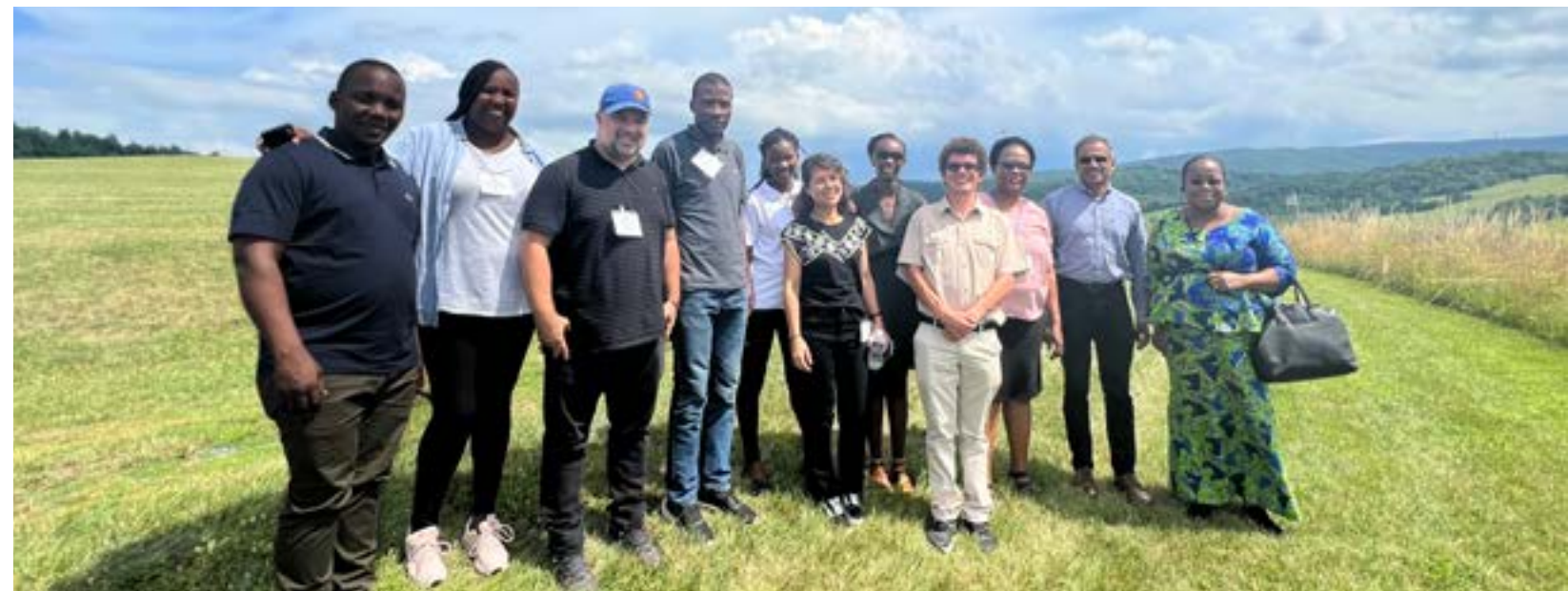
An IVLP delegation visits the Smithsonian Conservation Biology Institute in Front Royal, Virginia.